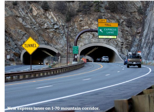
New express lanes on I-70 mountain corridor.