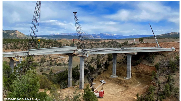
US 550-US 160 Gulch A Bridge.